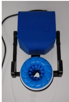
Figure 3. Toy correctly positioned inside the bands (top view)

Proper placement is achieved when the bands and toy are equally centered as pictured below. If the toy isn't directly centered, gently pull on each arm to stretch and work the bands into position or push on the bands directly with your fingers. If positioning is way off, you may need to remove the band and try again.