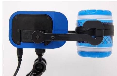
Figure 4. Toy correctly positioned inside the bands (side view)