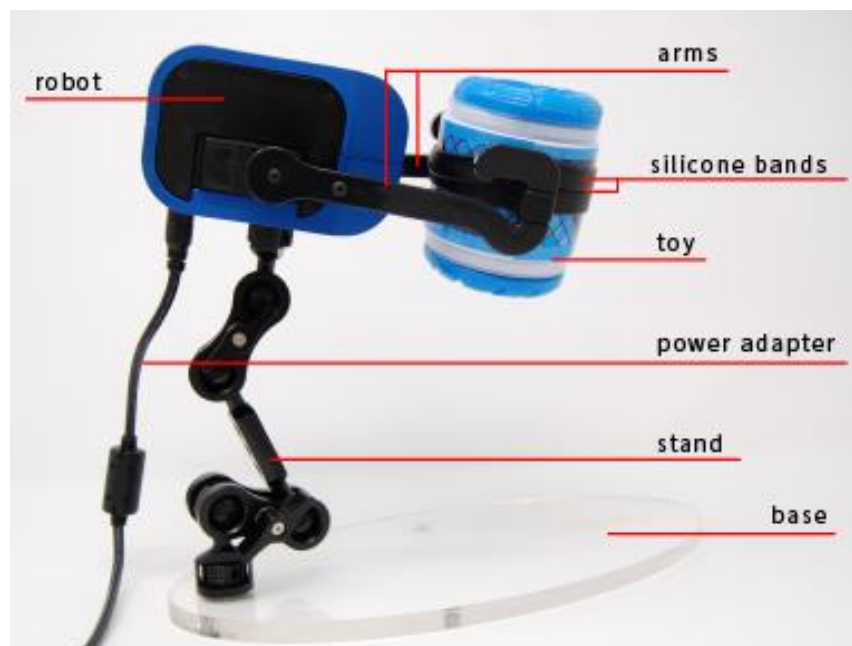
Figure 1. RUBJOY SCHEMATIC [not visible: plastic spacers]