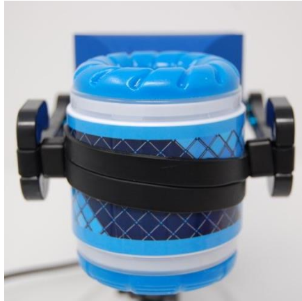
Figure 2. Bands and spacers correctly installed on toy.

Proper placement is achieved when the bands and toy are equally centered as pictured below. If the toy isn't directly centered, gently pull on each arm to stretch and work the bands into position or push on the bands directly with your fingers. If positioning is way off, you may need to remove the band and try again.